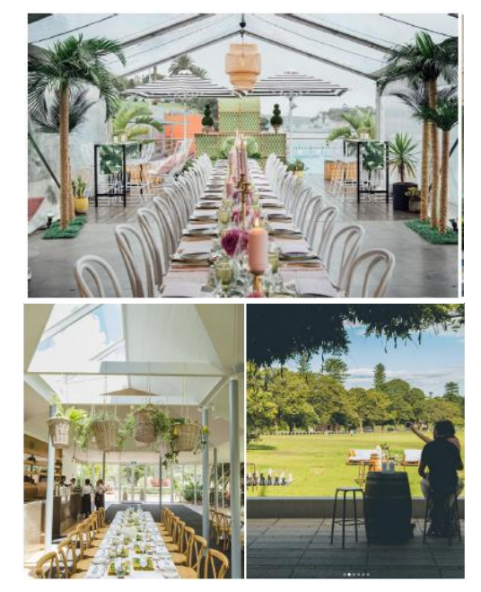
Examples of potential venue